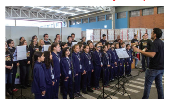
FISA's social contribution activities

The FISA program "Preparing Children for the Future" is not simply about teaching. It conducts activities that enable a better future for underprivileged children by educating, guiding and giving them hope. Some of the children living nearby work at FISA and other companies as trainees while still minors and as full-time employees later. Of these youngsters, some receive an annual scholarship to help them through technical school.