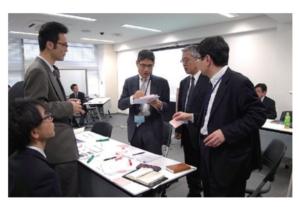
Setup training of the emergency headquarter (Information control at headquarters secretariat)