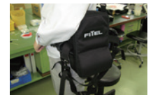
⑥-2 Working Belt in Action