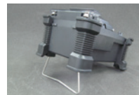
⑤ Angled Stand in Action