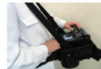
⑥-1 Working Belt in Action