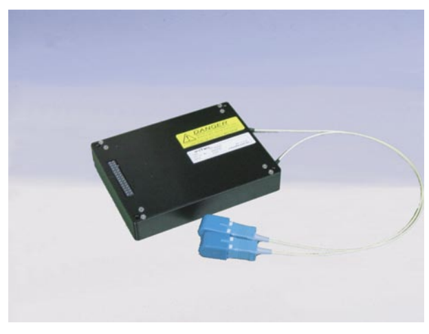
Photo 1 Compact size erbium doped fiber amplifier with fast transient control.

The EDFA developed here consists of a pumping laser module and a variable optical attenuator, enabling highperformance operation with a saturated output power of not less than 17 dBm and a variable gain range of not less than 10 dB. The optics comprise a small diameter erbium doped fiber (EDF) with reduced length due to high concentration doping and downsized optical components such as compact isolator. In addition, the small package measuring 70 \times 90 \times 15 mm has been realized thanks to the two-stage layout for the control circuit. See Photo 1. It is possible to externally change the control mode and to monitor alarms through RS232 serial communication. The control modes include automatic gain control (AGC), automatic level control (ALC), and automatic current con-