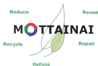
The MOTTAINAI mark is FISA's original concept

The program contributes to the three main pillars of sustainability — Environment, Society and Economy — and provides benefits to participating customers too, thereby generating new business opportunities for FISA. By 2014, the program had expanded to include customers in Argentina and Chile.