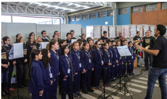
FISA's social contribution activities

The FISA program “Preparing Children for the Future” is not simply about teaching. It conducts activities that enable a better future for underprivileged children by educating, guiding and giving them hope. Some of the children living nearby work at FISA and other companies as trainees while still minors and as full-time employees later. Of these youngsters, some receive an annual scholarship to help them through technical school.