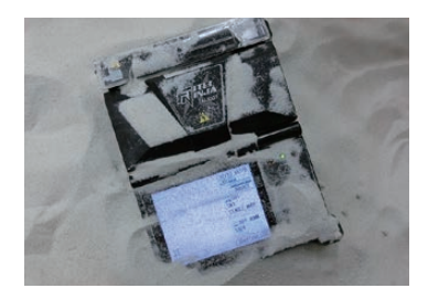
Dust Resistance Equivalent to IP5X rating dust proof *2)

*2) Standard operations could be properly carried out after having conducted the above tests. These tests were performed at the Furukawa Electric Lab with no significant damage. This does not guarantee that the machine will always be undamaged under these conditions.