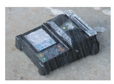
Water Resistance Equivalent to IPX2 rating drip proof *2)

Drop Resistance 76 cm drop tests from 5 different angles ^{*2)}