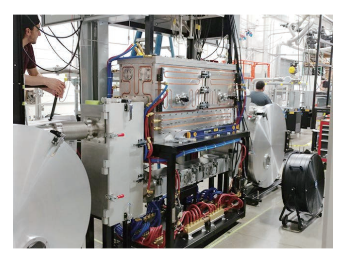
Figure 6 MOCVD equipment.