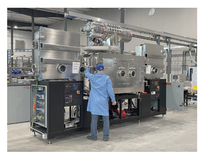
Figure 5 IBAD equipment.

In the area of production technology development, under the slogan of "Making superconductivity a familiar technology," we are working to develop quality, consistency, productivity, and low cost by taking advantage of our strength in the MOCVD process and refining the buffer process (Figure 5-7).