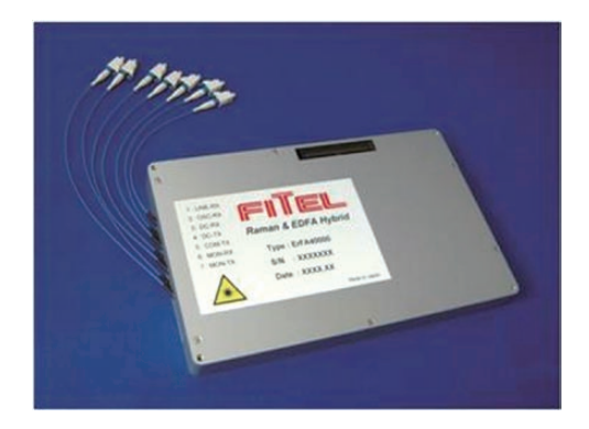
Figure 1 ErFA40000 series.

To meet the demand for optical amplifiers for the ultrahigh bit rate transmissions systems, Furukawa Electric has commercialized a space-saving and a low price Raman EDFA by combining Raman light sources and an EDFA in one package. The detailed specifications of the product for usage environmental condition, the Raman pump module and EDFA are shown in Table 1.