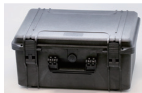
Hard Carrying Case