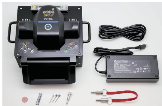
Standard Package (S185ROF)