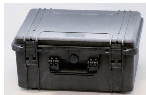
Hard Carrying Case